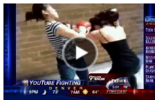
Video shows high school students fighting on ca...