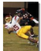
Maryville vs Science Hill Football