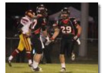
Maryville vs Science Hill Football